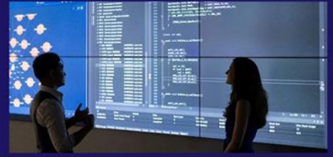
Delivering digital at scale