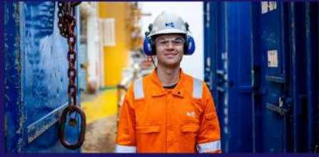
Innovating in oil and gas