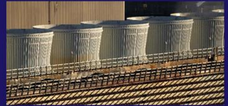
Scaling new energy systems